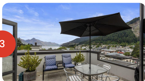
Cecil Peak Penthouse Apartment